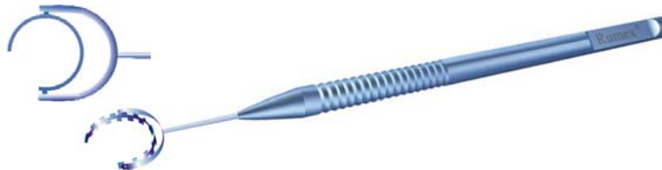
Cvintal Asymmetric Phaco Fixation Ring