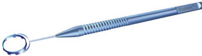
Thornton RK/AK Fixation Ring